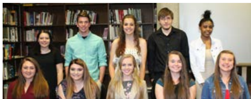
Academic Top Ten 2017