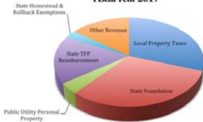
Where the Money Comes From General Fund Revenue Fiscal Year 2017