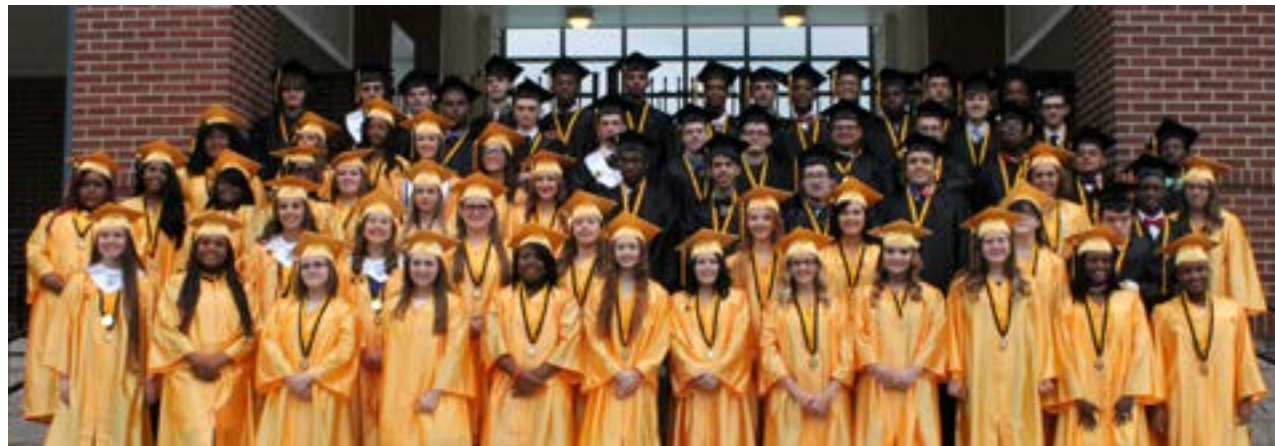
Class of 2017

The academic program provides a variety of opportunities for every student to reach his or her full potential.